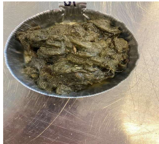
Fig. 1. Channel catfish stomach containing filamentous green algae.

Stomach contents were collected from 38 channel catfish (345-620 mm TL). Across the 38 stomachs processed, a total of nine diet contents were found. Of the 293 diet items processed, four zebra mussels were consumed. Conidae were the most common diet item to be found, as they accounted for 74.40% of the diet items in channel catfish. Crangonyctidae were the second most common prey item found accounting for 16.38% of the diet items, while the third most common was Lepomis spp. accounting for 0.04%. Filamentous green algae were also found in the channel catfish stomachs, as 47.37% of stomachs contained algae (Figure 1).