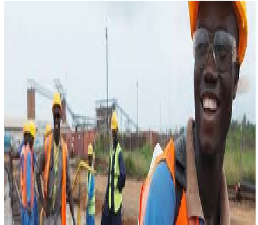
Workers at a Construction site.