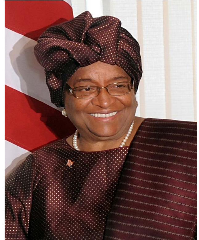
Her Excellency, President Ellen Johnson Sirleaf