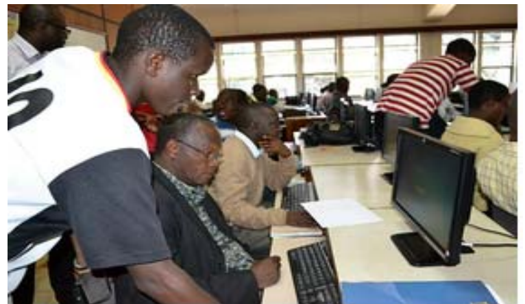
Staff being trained in the lab.