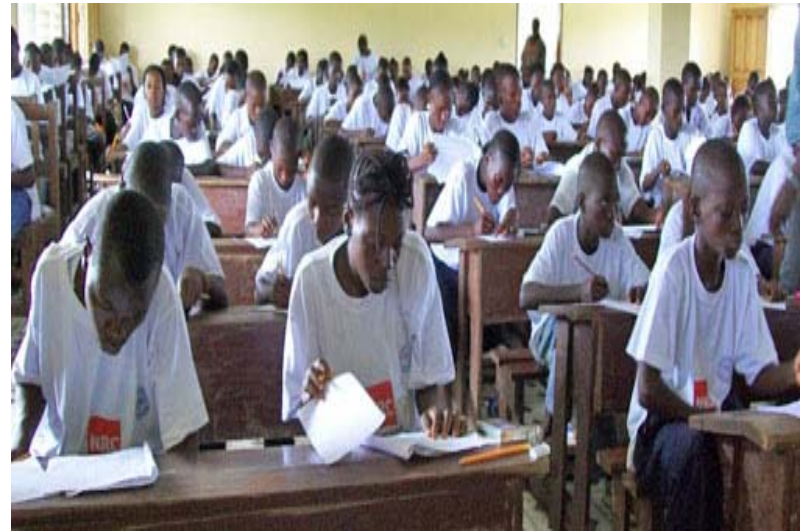
Partial view of class room in Liberia.