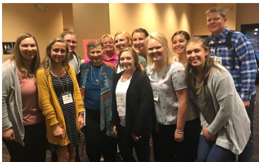
Senior nursing students attending conference