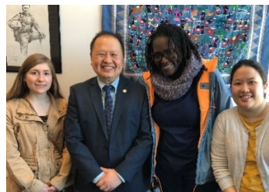
Student Nurses Day on the Hill