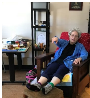
Live actor simulation