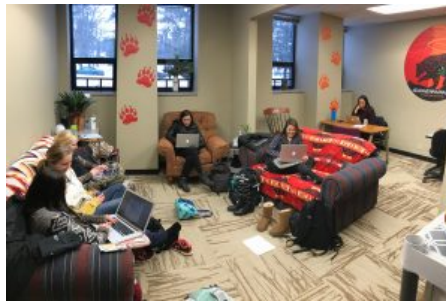
Niganawenimaanaanig Student Lounge

Photo from 4/18/19 Niganawenimaanaanig Student Gathering. Following our group gathering we attended the American Indian Resource Center (AIRC) Awards Recognition Banquet to honor those graduating and those with academic achievements.