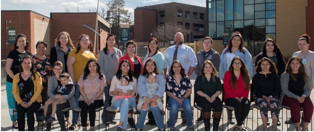
Photo from 4/18/19 Niganawenimaanaanig Student Gathering. Following our group gathering we attended the American Indian Resource Center (AIRC) Awards Recognition Banquet to honor those graduating and those with academic achievements.