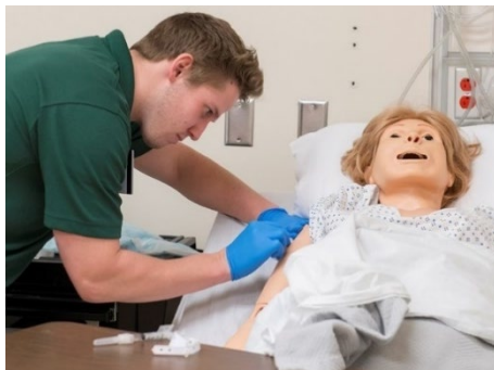
Sophomore – Introduction to Clinical Practice