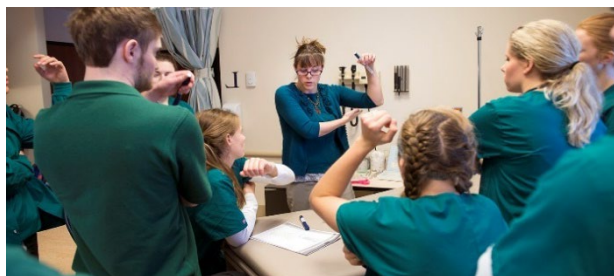
Sophomores in Introduction to Clinical Practice