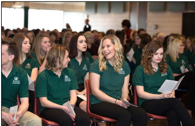
Induction Spring 2018

We accepted a total of 63 new students starting the spring of 2018. We are in the process of refining our holistic admission process, which will increase our ability to see the applicants more completely and not just based on their academic records. The new uniforms have been a hit as we switch from polos to scrubs for our hospital settings.