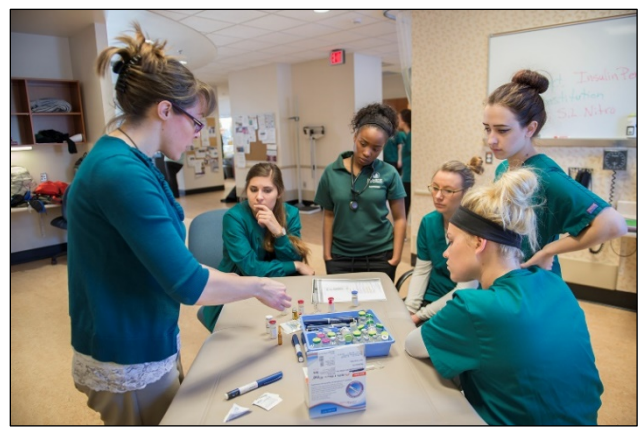
Faculty demonstrating skills