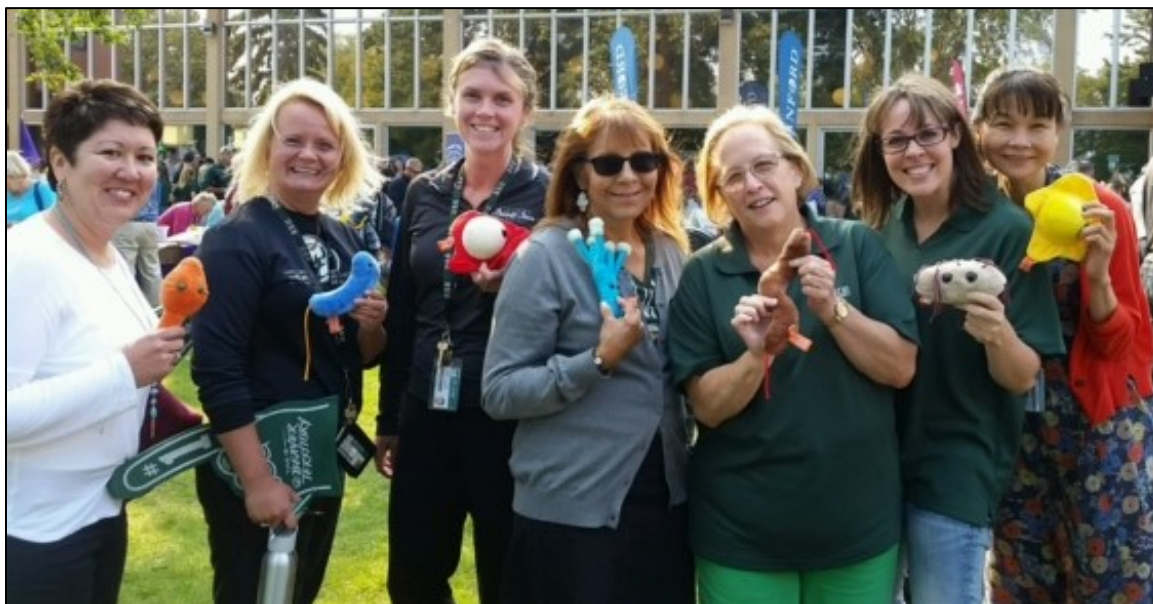
Community Appreciation Day

The BSU Department of Nursing faculty and staff are looking forward to the opportunities of another year and invite you along for the journey!