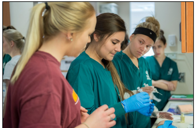
Introduction to Clinical Practice