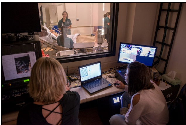
Faculty running a simulation

Faculty and student have worked hard to expand their learning through our skills lab and use of high definition simulation. We have added a communication manikin called Alex. He talks and responds to questions! We also have successfully obtained our new simulation mom and simulation newborn baby, enabling us to run a complete birthing simulation. Other new lab equipment includes a crash cart, a personal protection equipment cart, and a geriatric manikin. We are also using online simulation programs such as Shadow Health and Centennial City to expand our RN-BS learning experiences.